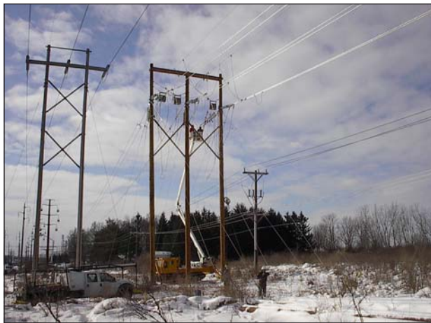
Hawkeye sagging wires in Rochester, NY February 10, 2007