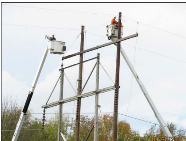
230 Kv Outage - Northline Utilities.