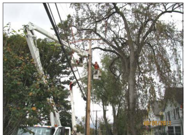
Local 1249 crews doing distribution work in Oneonta, NY ~ Northline Utilities ~