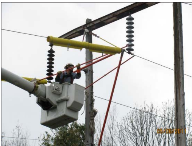
1249 JL Dan Bressette - Hot Sticking 115 Kv - Harlan Electric